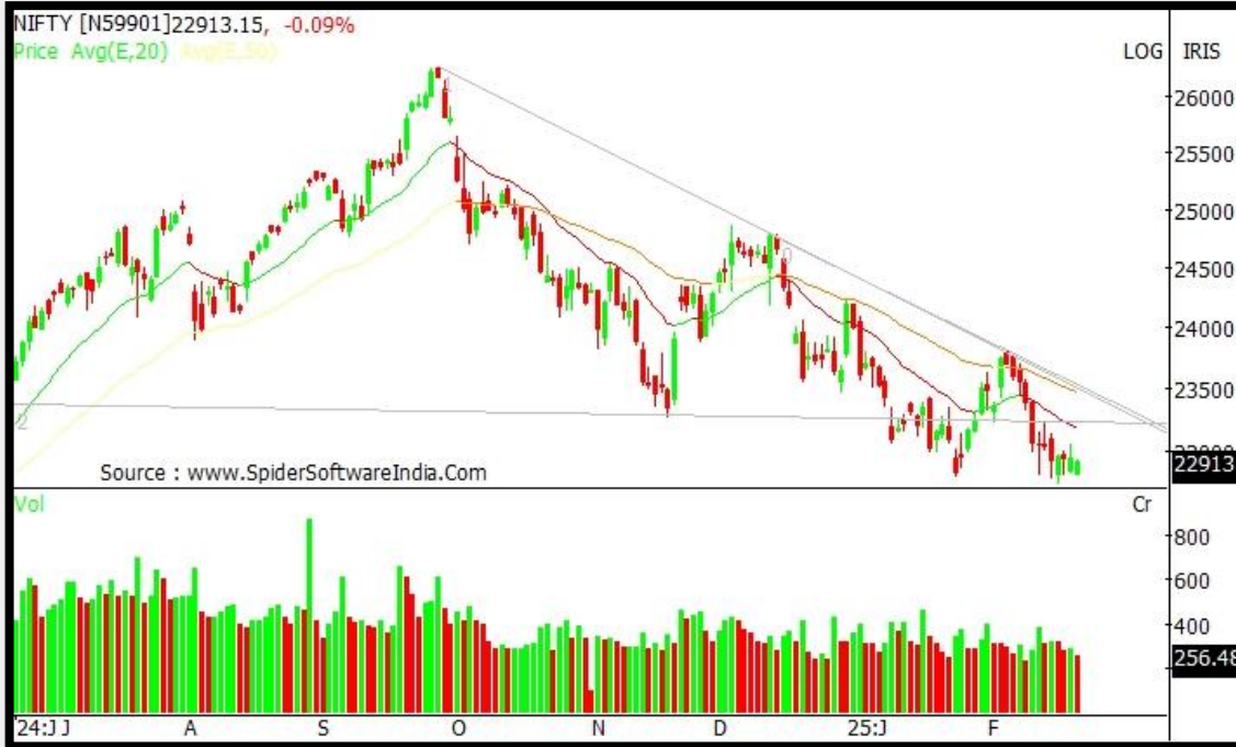
Daily Chart (22,913.15)